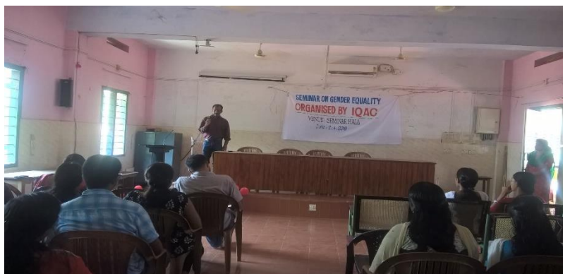
Seminar on Gender Equality