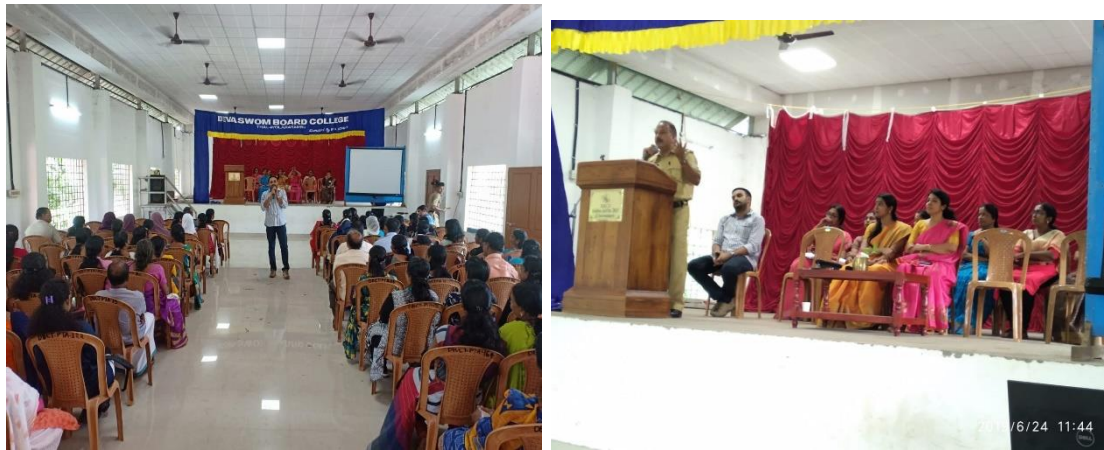
Photos of Induction Programme