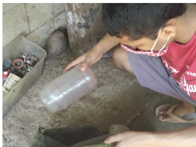
Volunteers collecting plastic waste