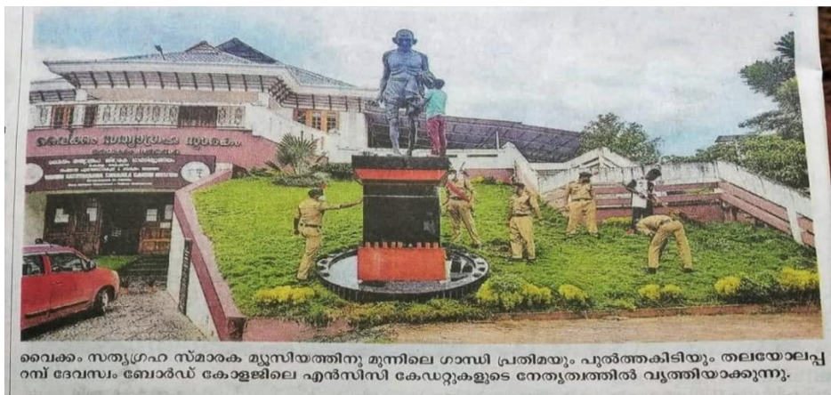
News in print media