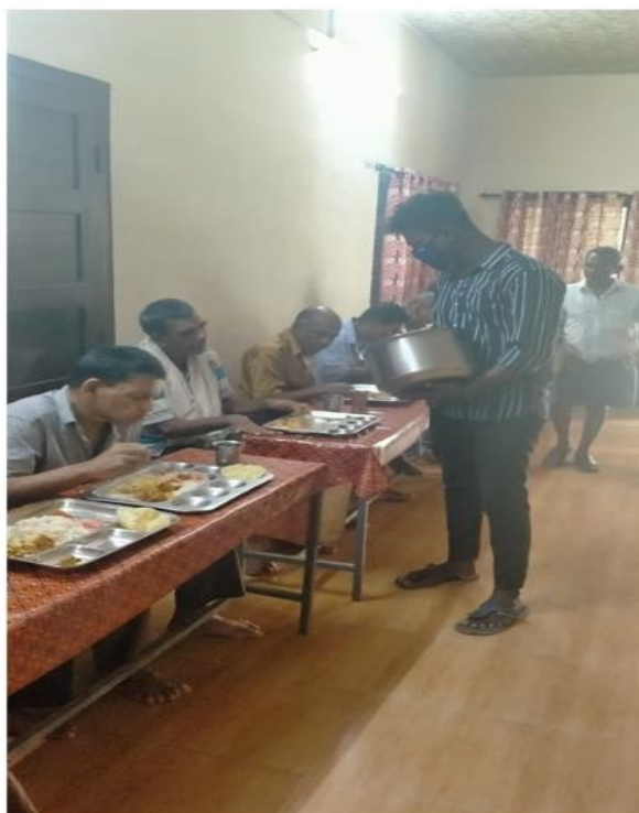
Volunteers serving food for inmates of Jeevitha Nilayom