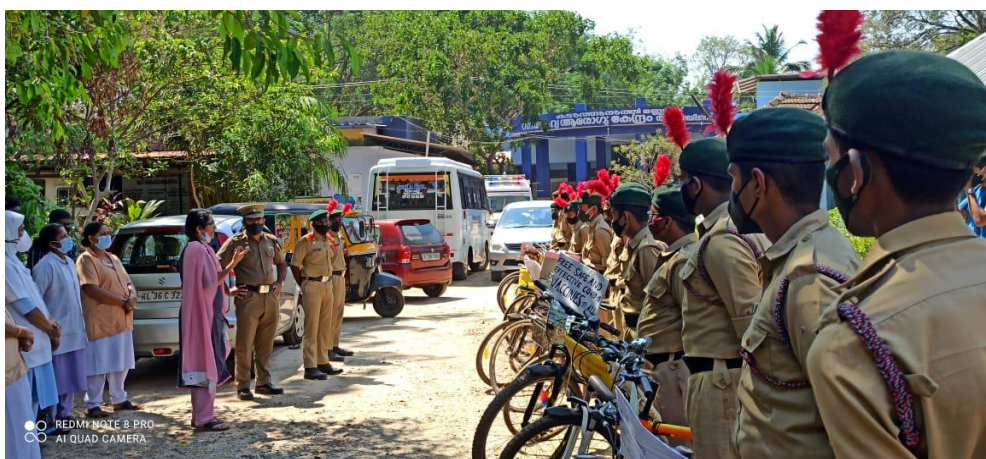
Glimpses from the bicycle rally