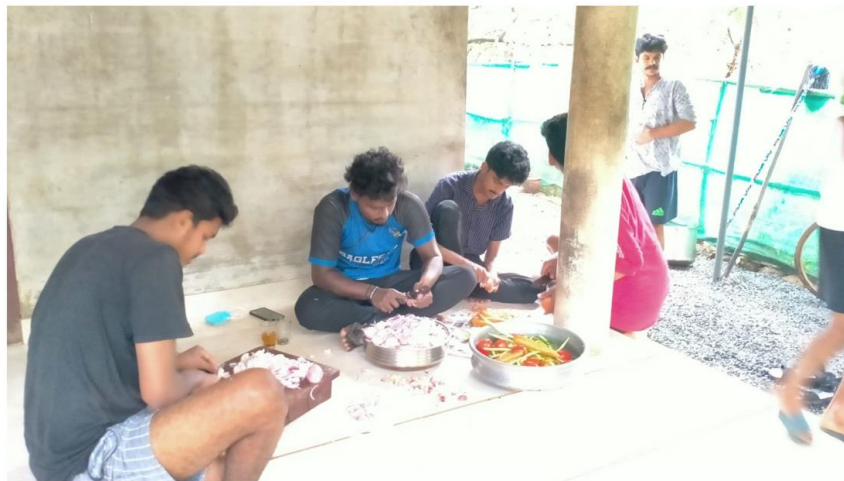
NSS volunteers cooking food for inmates of Jeevitha Nilayom

As part of serving the society five NSS Volunteers cooked food and distributed to the members of a poor home named “Jeevitha Nilayom” using self-collected funds.. The volunteers cooked ‘ Kerala Sadya ’ on 3 rd January 2021 by maintaining strict Covid protocols and this was the first offline activity of the academic year. 15 students participated.