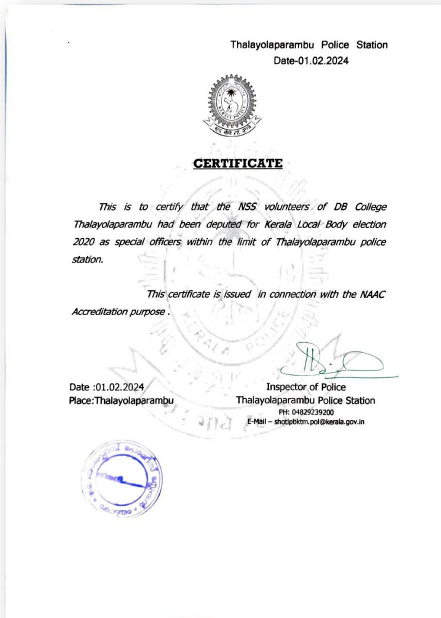
Certificate attesting the participation of NSS volunteers in Kerala local body election

NSS volunteers of Devaswom Board College, Thalayolaparambu assisted Thalayolaparambu and Vaikom Police Stations for the formation of Special police officers (SPO). The SPOs were created to assist the police force for the smooth conduct of Kerala local body election. The training programmes lasted one week starting from 7 th December 2019 to 14 th December 2019.