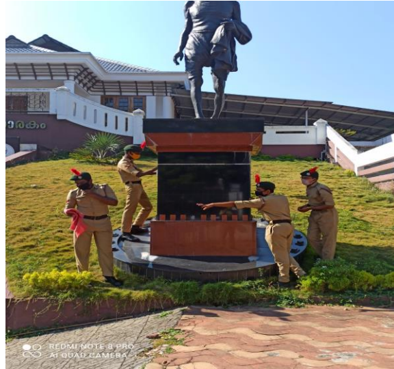
NCC cadets involved in cleaning activity at Gandhi statue