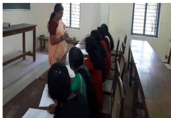
Remedial class sessions