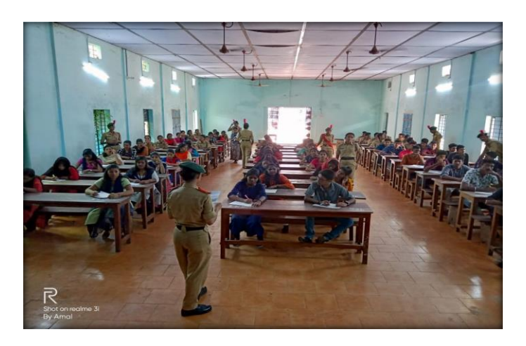
From Quiz competition