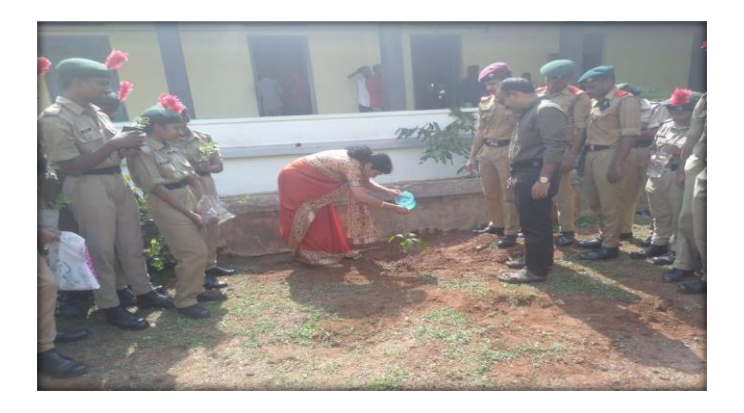
Planting tree saplings by Principal

• On June 4, 2019, the NCC unit of Devaswom Board College, Thalayolaparambu marked World Environment Day with a dual approach, tree planting and campus cleaning. To promote environmental awareness, a quiz competition was organized.