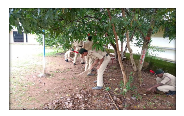
Campus cleaning by NCC Cadets