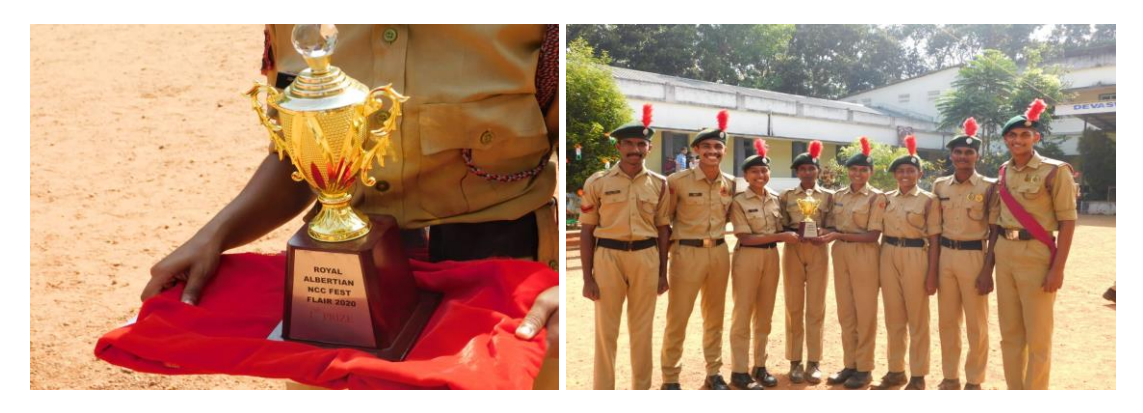
Cadets with Trophy

• NCC unit of Devaswom Board College, Thalayolaparambu won the first prize for guard of honour, extempore and quiz competitions held at St. Albert's College, Ernakulam on 15<sup>th</sup> January.