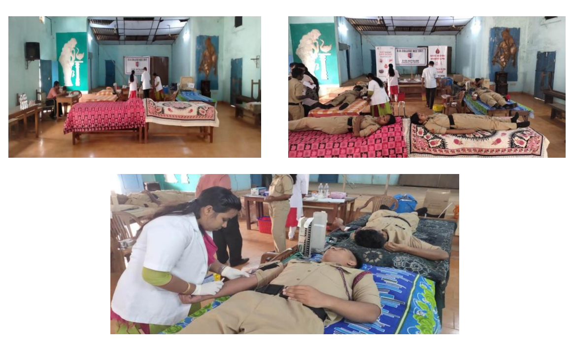
From the Blood donation camp