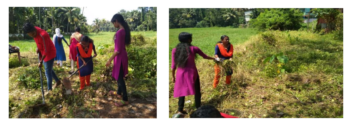
NSS Volunteers cleaning Thalayolaparambu park

• Cleaning of Thalayolaparambu Park: On 21/09/19, NSS volunteers of Devaswom Board College, Thalayolaparambu cleaned Thalayolaparambu park