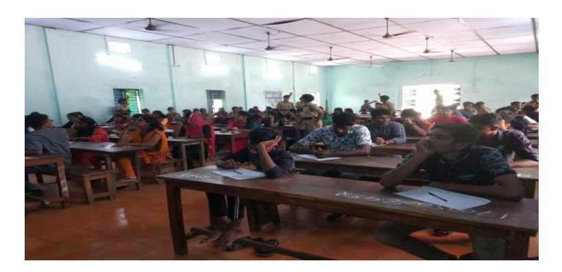
From Quiz competition on Gandhi Jayanthi

• Gandhi Jayanthi Celebration: On 1<sup>st</sup> October, in connection with the birth-anniversary celebration of the Father of our nation NCC has conducted a quiz competition and poster exhibition. Students from various departments participated in the event.