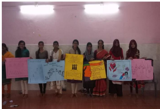
Students during poster competition