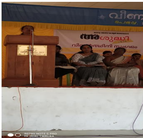
Women’s Day Celebration