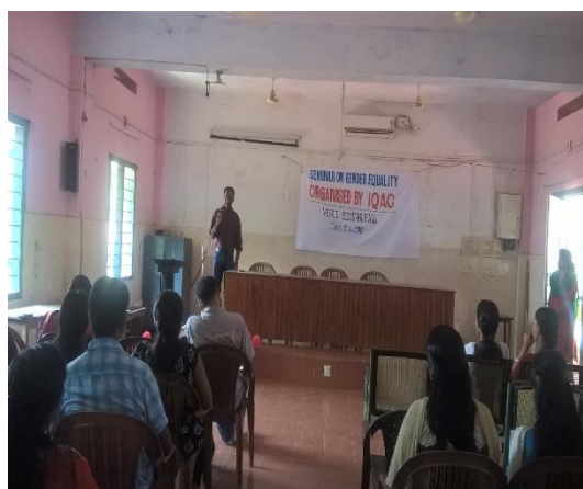
Seminar on “Gender Equality- A Conceptual Outlook”