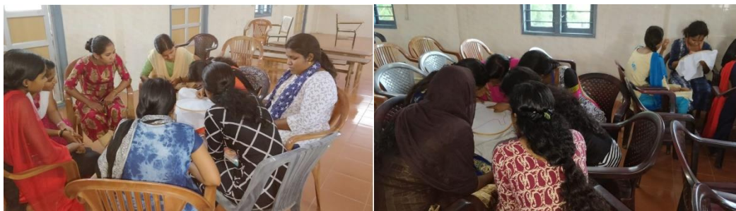
Students during embroidery class