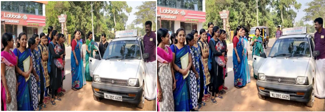
Driving class for girl students