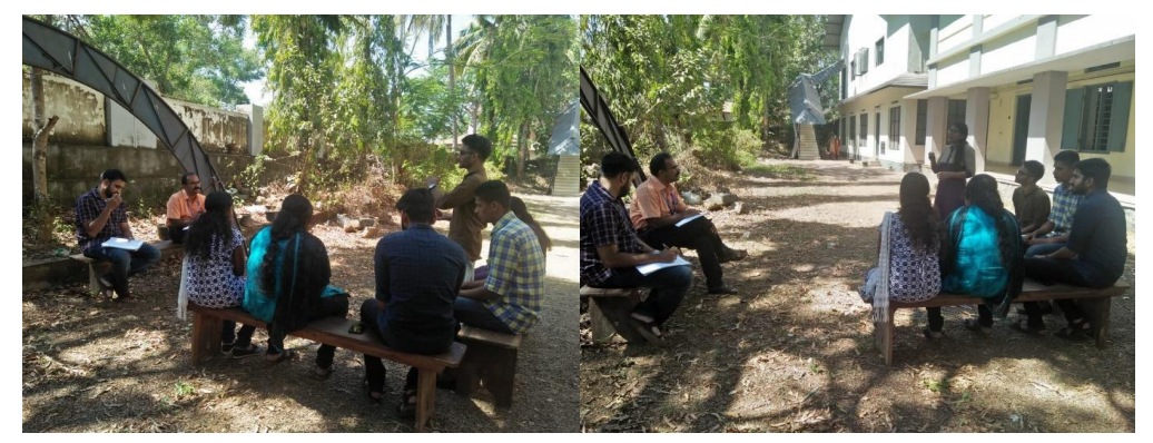
From debate on "Environmental exploitation is necessary for development"