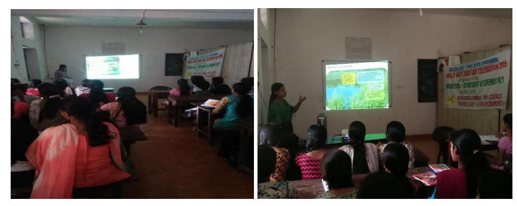
From the slideshow presentation during the programme