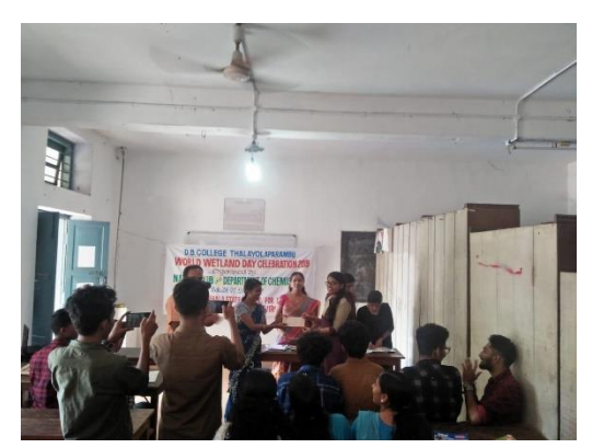
Cash prize given to winners of quiz competition