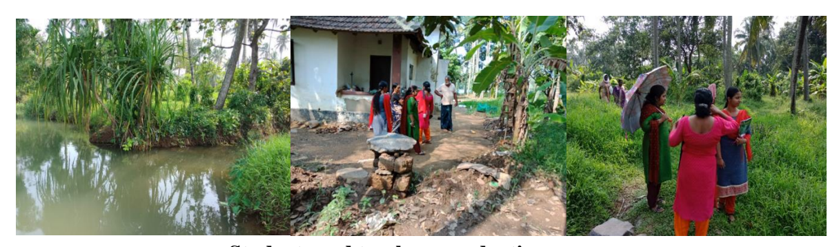
Students and teachers conducting survey

• Survey on rapid assessment of biodiversity loss after flood: Selected 1<sup>st</sup> and 2<sup>nd</sup> year students of B.Sc. Botany participated in a field survey entitled 'Rapid Assessment of Biodiversity loss after floods' in Vellur and Maravanthuruth Grama panchayats from 16/10/18 to 30/10/18. This was a programme planned and carried out as per the instructions of Kerala State Biodiversity Board. The report of survey findings was given for compilation by the 'Biodiversity Board' which submitted the consolidated report with recommendations to the Government.