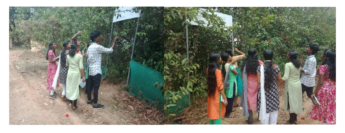
Biodiversity audit -Enumeration of trees in the campus

Biodiversity audit for the year was done by the enumeration of trees in the campus. The I<sup>st</sup> B.Sc. Botany students who are the club members, were given a chance to identify the tree species.