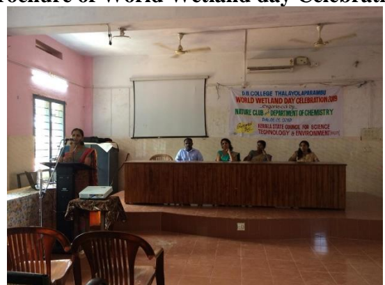
Inaugural session of Wetland Day Celebration

Brochure of World Wetland day Celebration