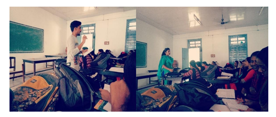
Seminar cum discussion on Regional Environmental issues among the students

• Assessment of plant diversity and analysis of vegetation of college was initiated on 09/02/19. The students were divided into groups and they enlisted the herbaceous plants to find out the region wise abundance of each species in the campus.