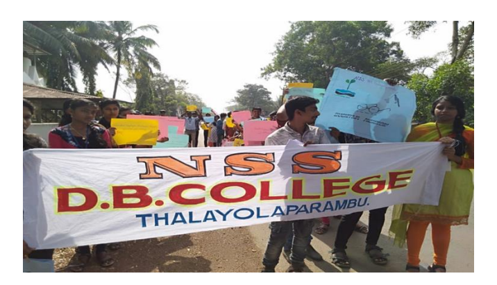
Students with posters during awareness procession

• Awareness Procession: N S S Unit of Devaswom Board College, Thalayolaparambu with Thalayolaparambu Gramapanchayath conducted an awareness procession on 'Swach Bharath-Clean Environment' as part of World Environment Day Celebration on 05/06/18.