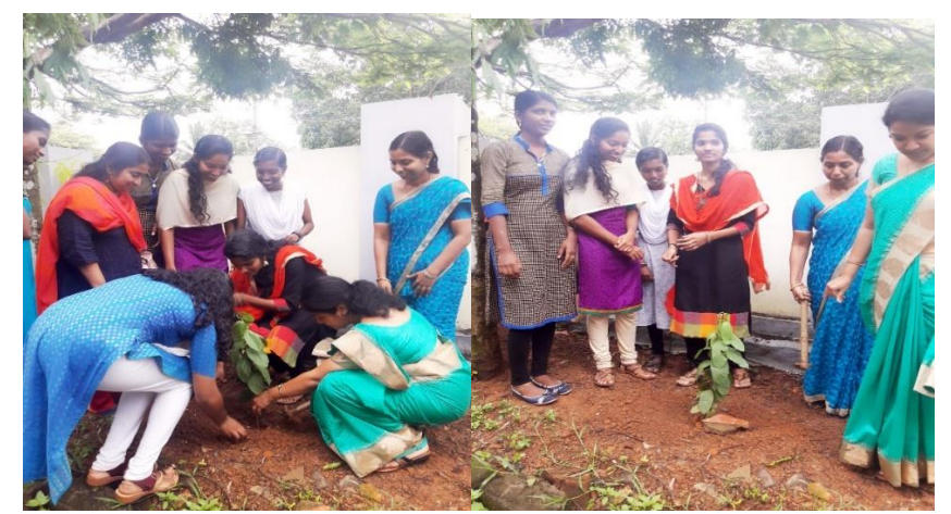
Inauguration of Environment Day celebration by tree sapling by Principal