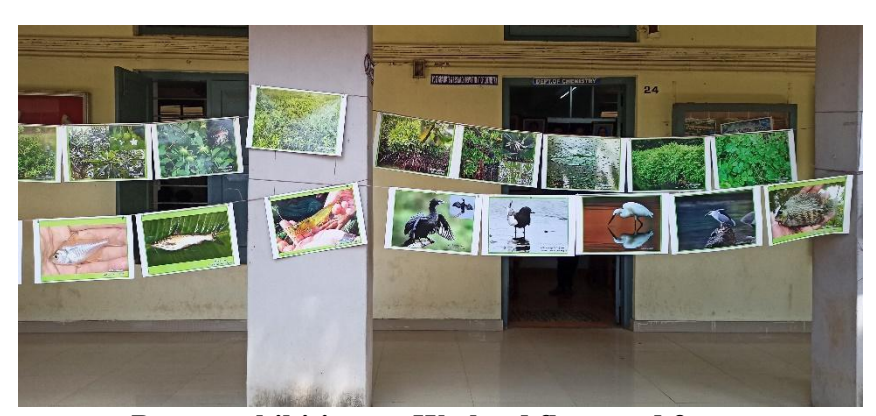
Poster exhibition on Wetland flora and fauna