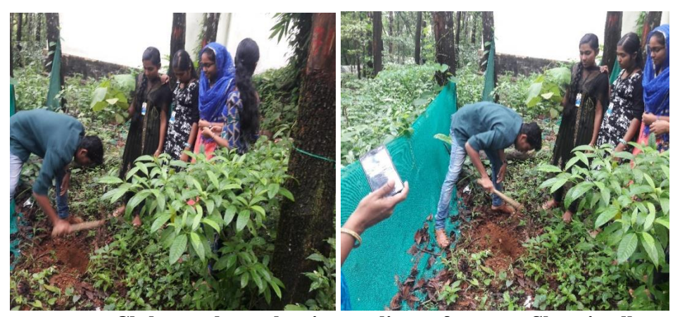
Club members planting saplings of trees at Shantistall

• Seminar cum discussion on Regional Environmental issues for Final Year students on 05/09/18. The students were given a chance to identify and discuss on the recent issues they face in and around their locality.