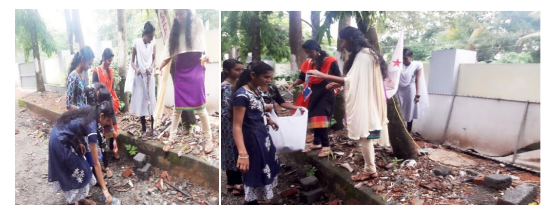
Campus cleaning by sorting plastics and other non-degradable wastes