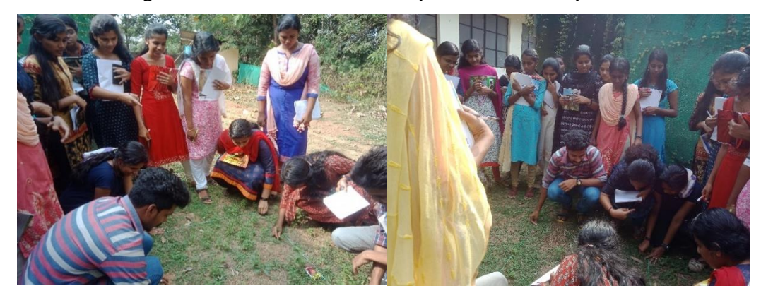
Assessment of plant diversity and analysis of vegetation

• Assessment of plant diversity and analysis of vegetation of college was initiated on 09/02/19. The students were divided into groups and they enlisted the herbaceous plants to find out the region wise abundance of each species in the campus.